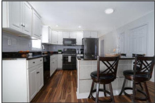
Breakfast Bar in Kitchen