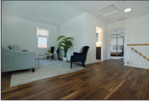
Second Floor with Private Suite