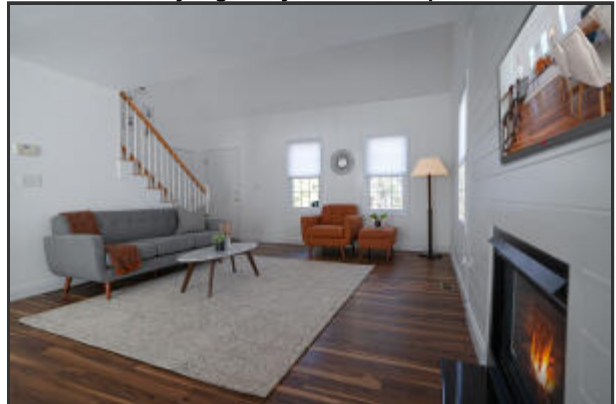
Cozy Nights By The Gas Fireplace