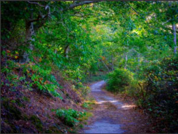
Trails All Around