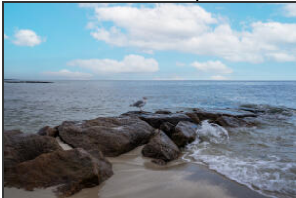
Beach Minutes Away