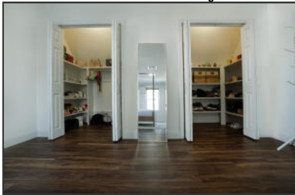
Two Closets with Shelving