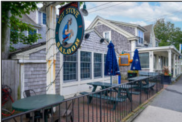
Hot Stove Saloon