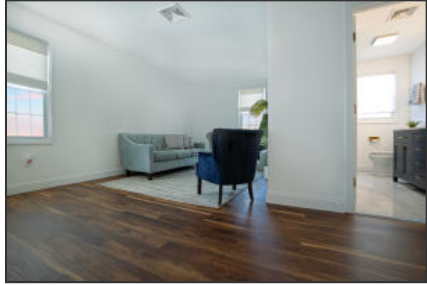
Living Area Connecting to Bathroom