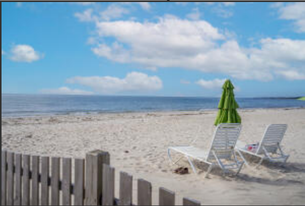
Relax Outdoors By The Ocean