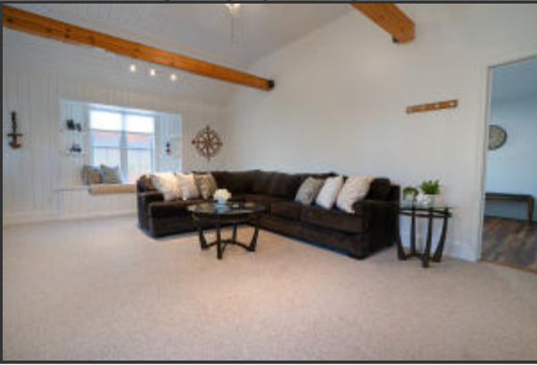
Garage Entryway to Family Room