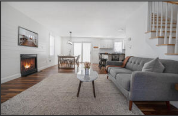
All Connected as One