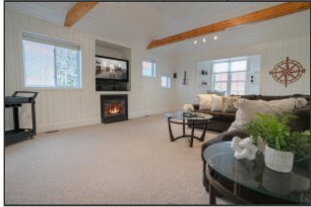
Room for All To Enjoy Movies Together