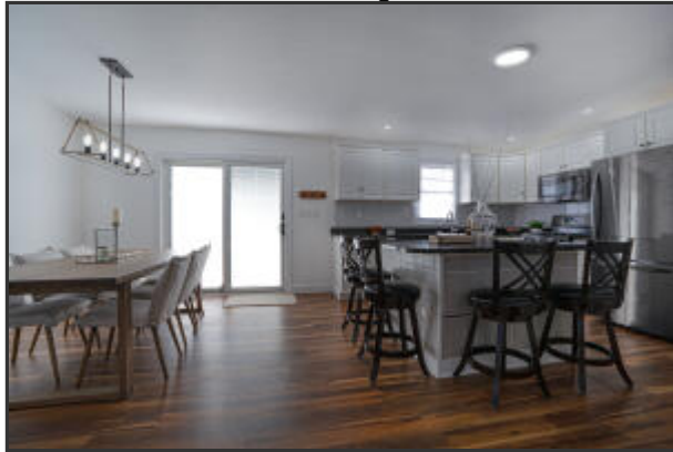
Kitchen & Dining As One