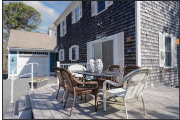
Back Deck & Garage View