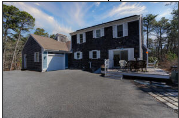
Back View of Property