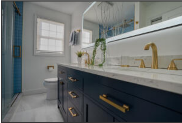
Bath in Second Floor Suite