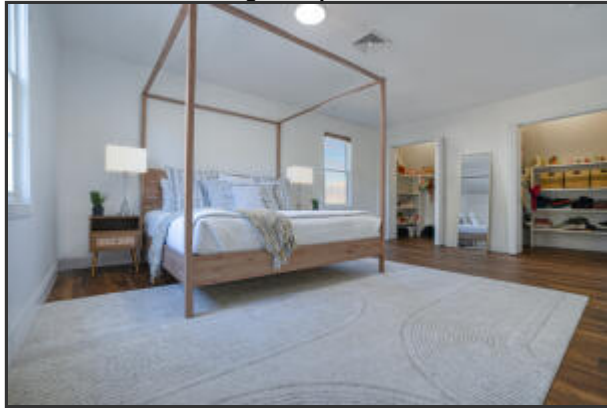
Bright & Spacious