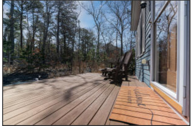
Dream On In