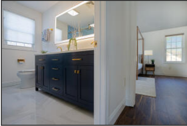
Suite Connects to Bath