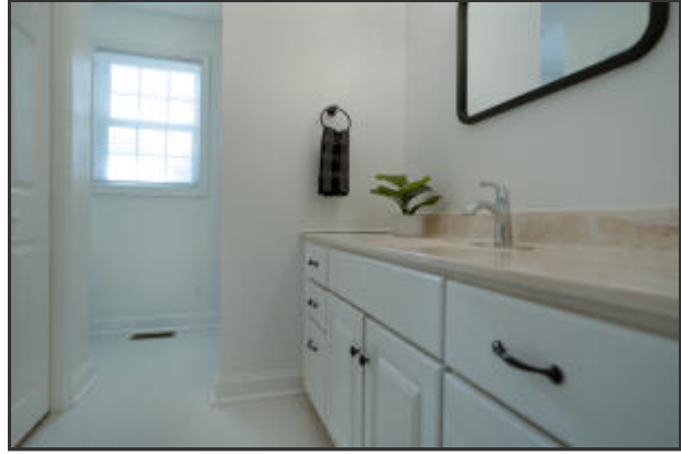
Full Bath In Lower Level