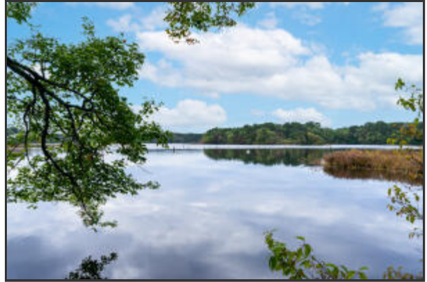
Ponds & Trails in Punkhorn Parklands