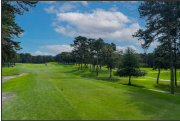
Cranberry Valley Golf Course