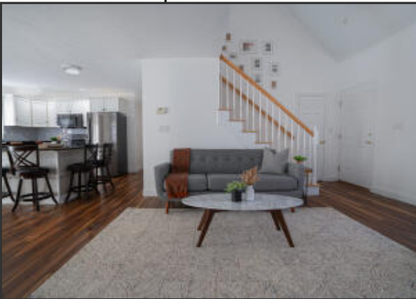
Open Floor Plan