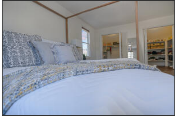
Spacious Enough for a King Bed