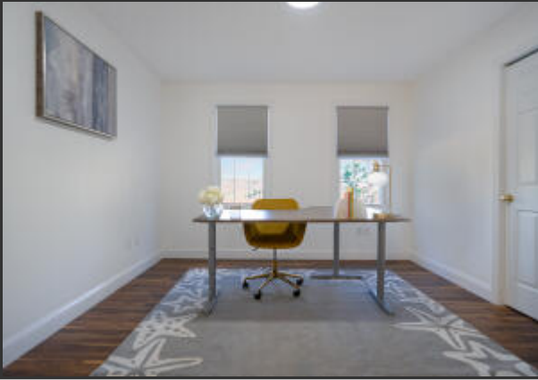
Office with Closet