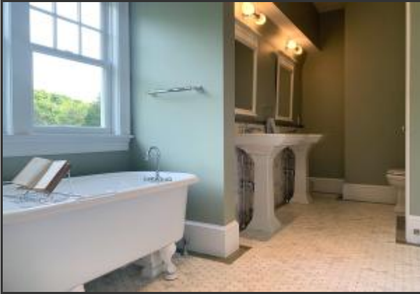
Clawfoot Tub & Double Sink