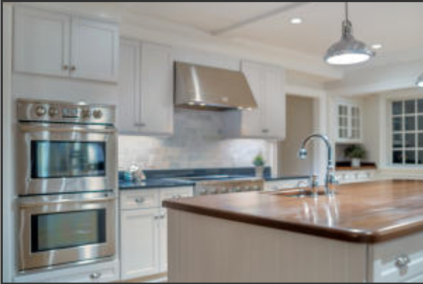
Cook & Join In The Fun Together