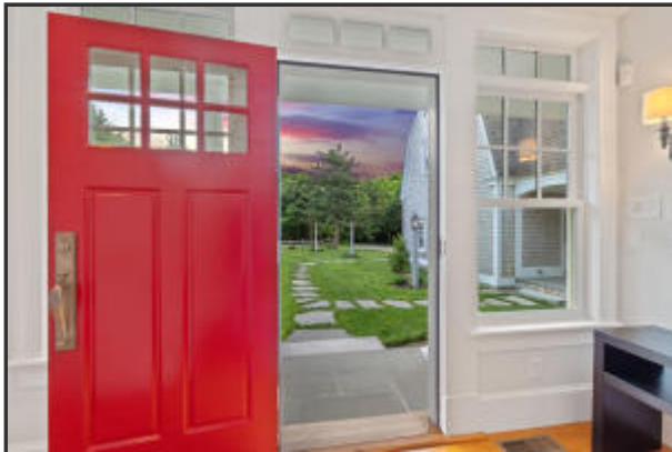
Dream On In