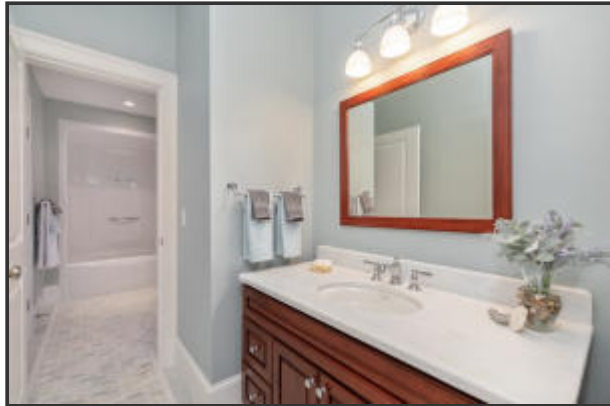
West Room Bath