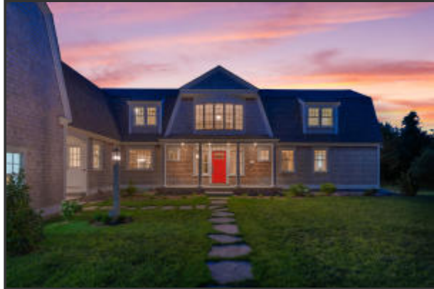
Historic Red Front Door