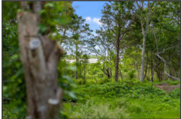
Out to Cape Cod Bay