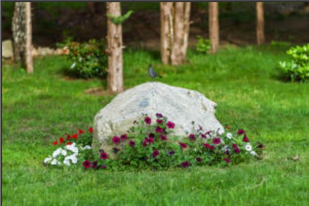
Simple & Classic