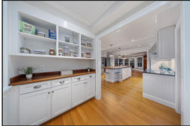
Adjacent Pantry Area