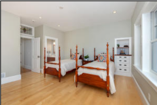
West Bedroom To Bath