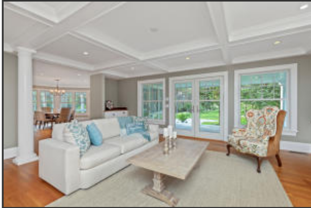
Living To Covered Porch