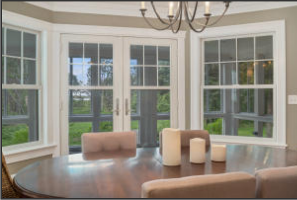
The Views Are Breathtaking