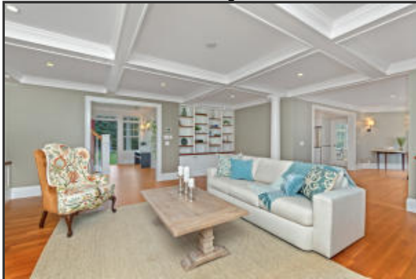
Formal Living Room