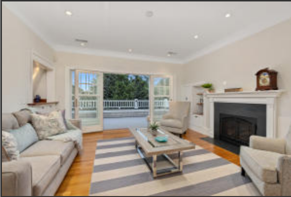
Family Room 137 Regatta Rd. 15MB-124