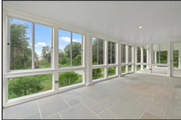
180 Degree Views of Nature & Beyond