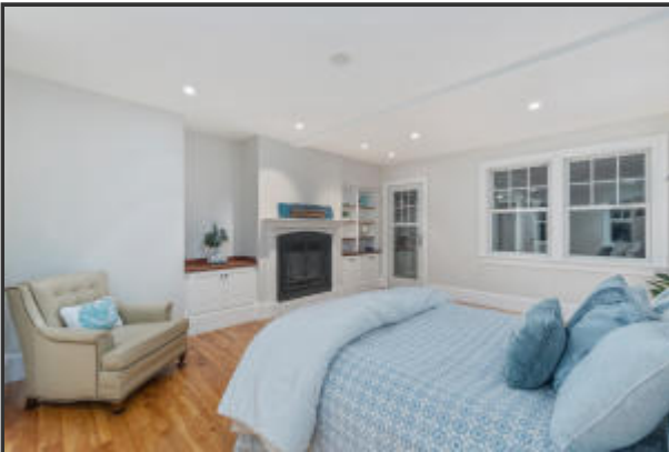
Bedroom to Covered Patio