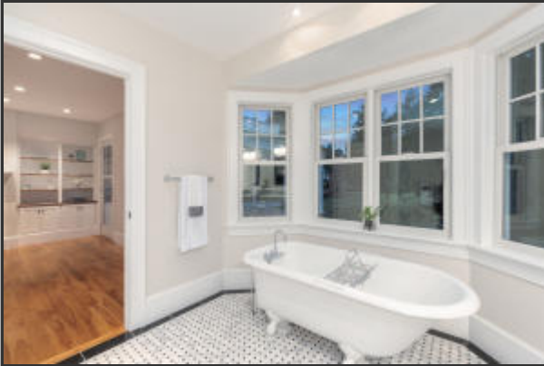
Master Bedroom to Bath