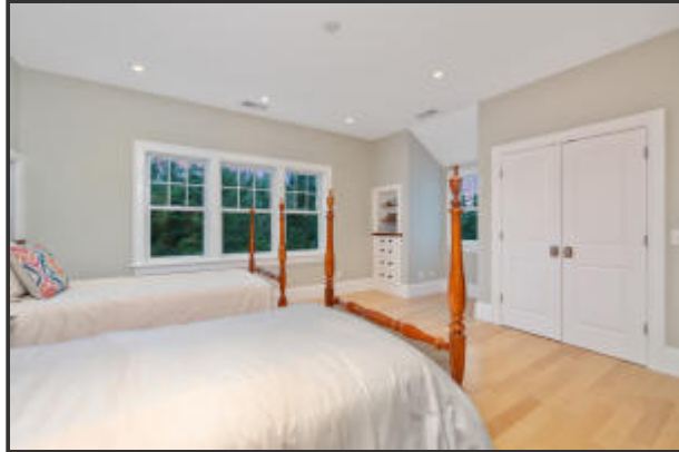
West Bedroom With Views