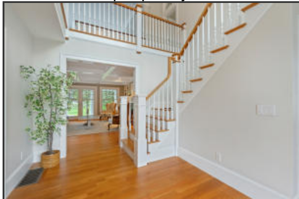
Open Space Foyer