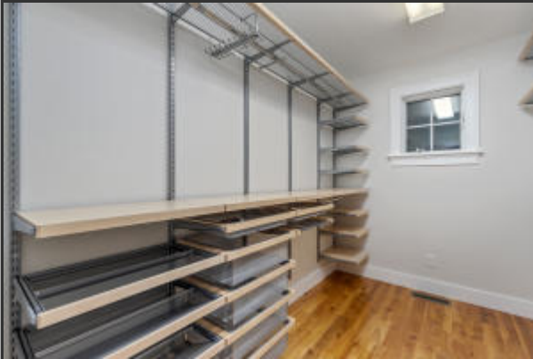
Walk In Closet