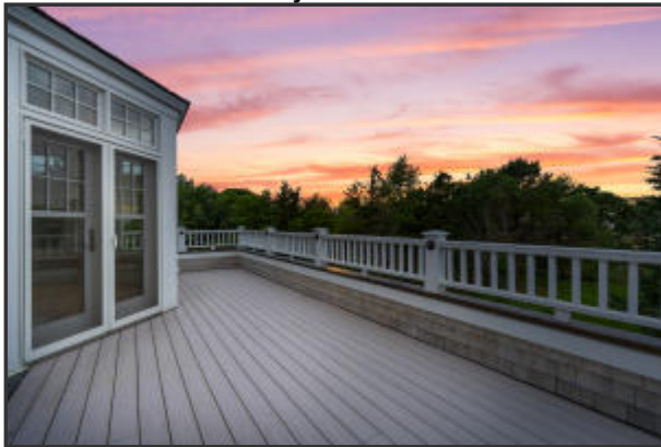
Balcony Off Bedroom