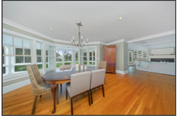
Open Yet Intimate Floor Plan