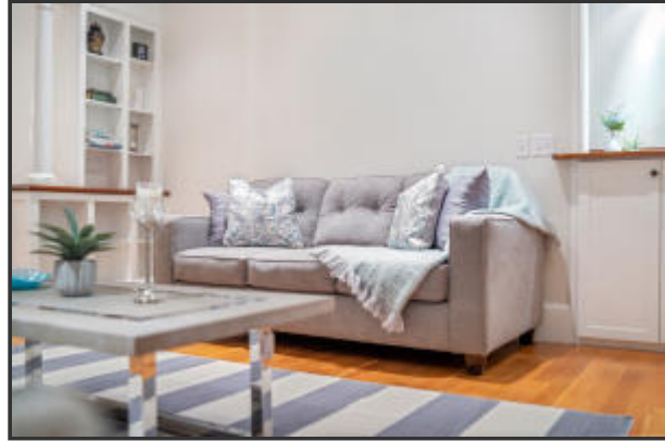
Easy Access To 2nd Floor Bedroom Areas