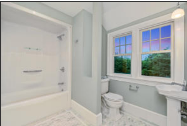
Full Guest Bathroom