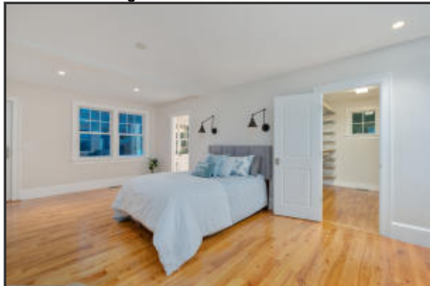
Entering 1st Fl. Master Master Bedroom