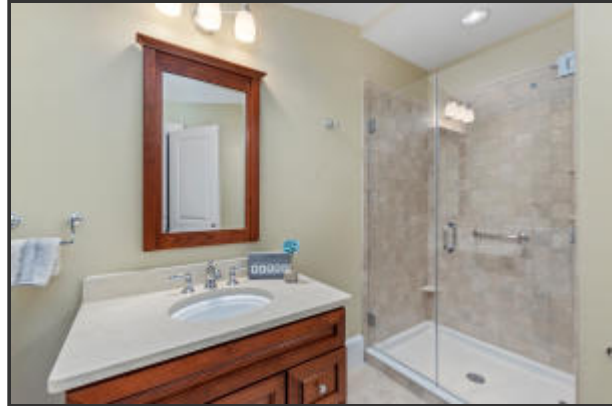
North Bedroom Bath