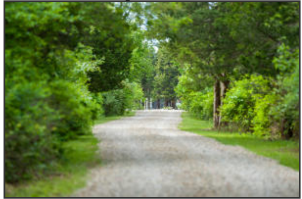
137 Regatta Rd. 7.9MB-1