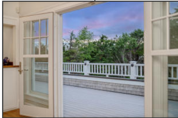
Take A Deep Breath