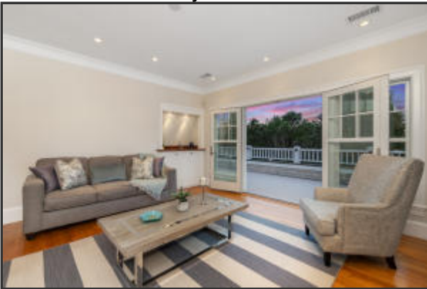
Family Room Fun