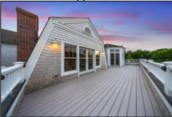
All Can Enjoy The Fresh Air