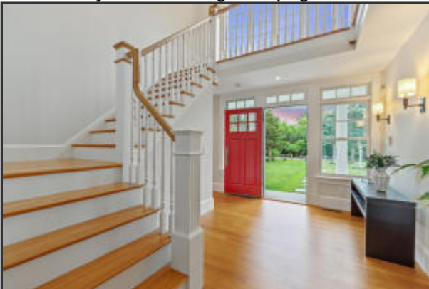
Foyer Divides Living & Sleeping Areas