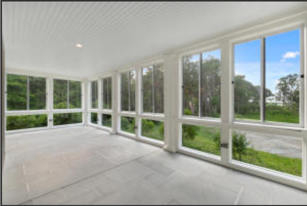
Sun Room Facing Northwest