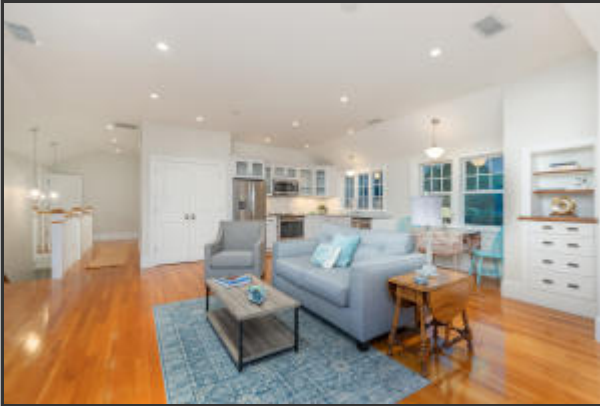
Upstairs Living Room