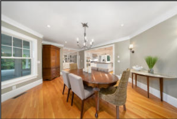
Dining To Kitchen