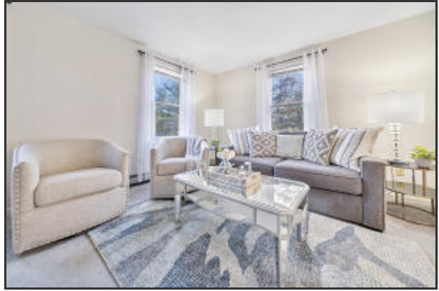
Views Everywhere You Look