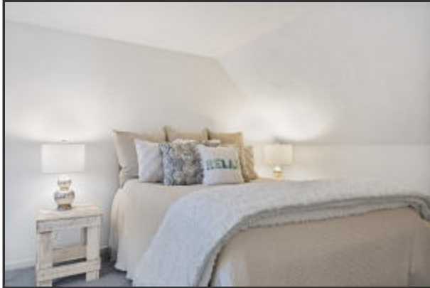
Time To Relax