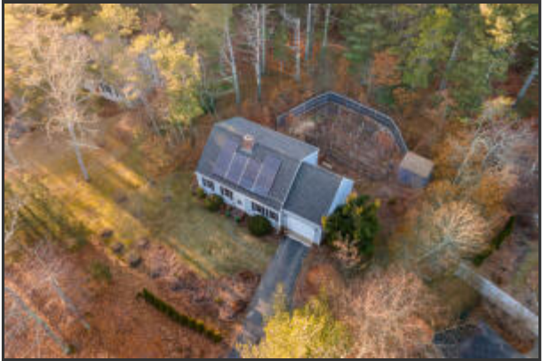
Aerial Shot Of Area