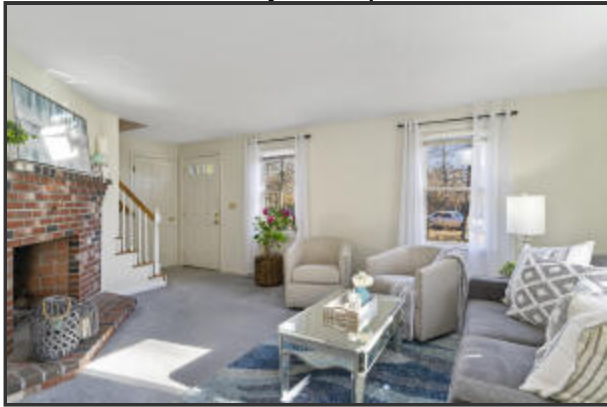
Relax By The Fireplace