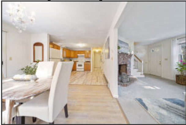
Living Room To Dining Room & Kitchen