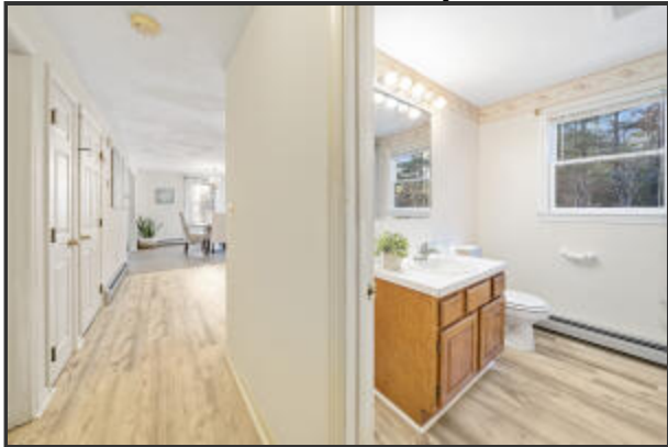
Bathroom To Hallway