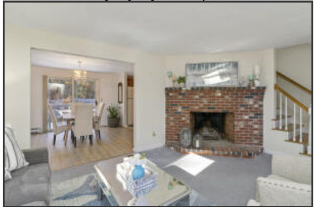
Cozy Days By The Fireplace