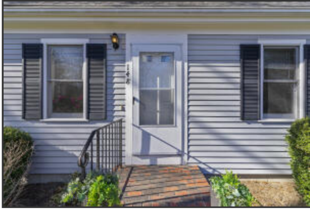
The Best Is Yet To Come