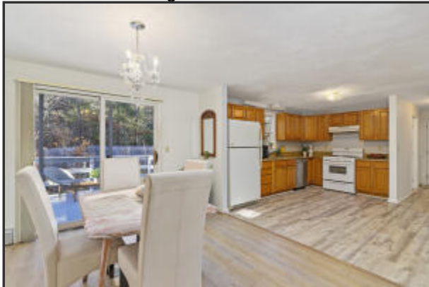
Dining Room To Kitchen