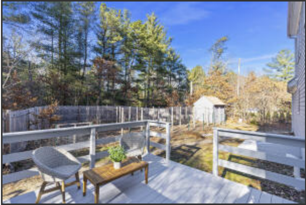
Gather Your Friends!