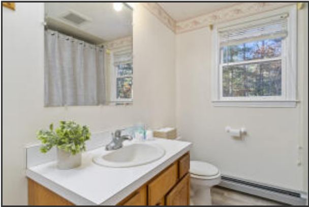
First Floor Full Bath