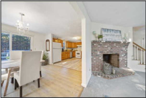
Your Favorite Meals