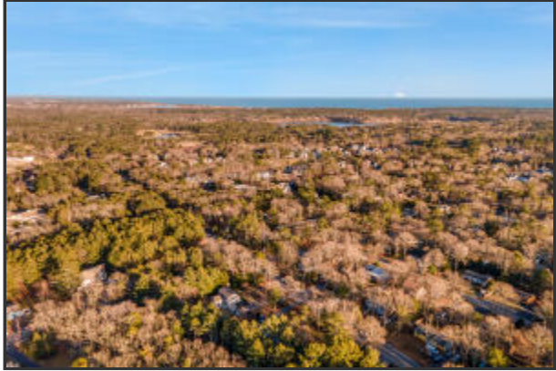
Aerial Shot Of The Neighborhood