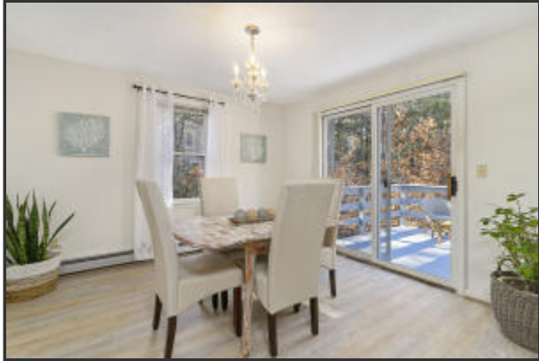
Family Time Awaits