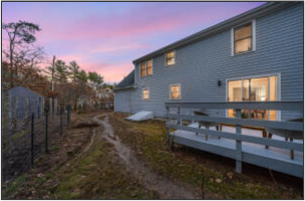
Beautiful Sunset Views