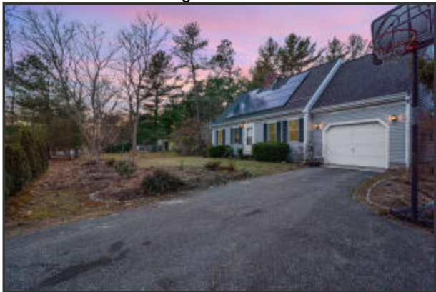
Large Front Yard