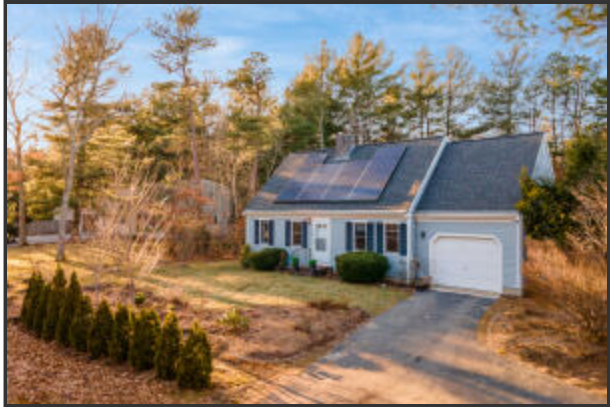
Turn-Key & Ready